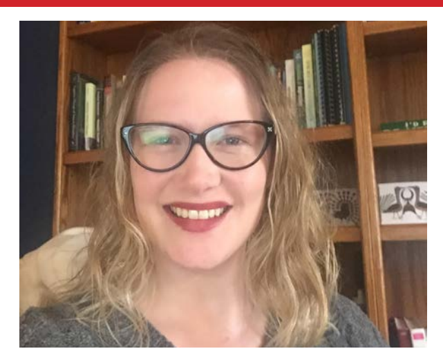
Student Awards - Best Masters Thesis and Best Doctoral Dissertation

Other factors that will be considered are the depth and breadth of the influence of the nominee's work on the profession of Evaluation rubric: counselling psychology (i.e., is it moving the profession forward; a) Contribution to knowledge and understanding in counhow many people have been affected by the work etc). Nomi- selling psychology; b) Originality; c) Quality of the renators should provide a rationale for nominating the individual search, as evidenced by (i) clear and compelling statement for the award, as well as supporting information (e.g., a current of research problem/question, (ii) appropriate methodol-CV, detailed descriptions of the nominee's work, samples of the ogy and methods, (iii) findings/results that are clear and work, independent evaluations of the work, letters of support show evidence of rigor, (iv) compelling and well-groundfrom colleagues, students and/or clients; description of posi- ed conclusions and implications, and (v) discussion of limitions held and /or service contributions). Please send nomina- tations; d) Quality of the writing The nominator should tions to larahiseler@gmail.com by May 15, 2017.